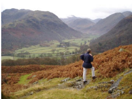
Borrowdale, Lake District

Members usually take food and drink with them. Two breaks are normally taken: a short mid-morning coffee stop and a longer one for lunch/dinner. The midday break is usually taken near a pub, where members can eat and have a drink - but, of course, nobody is forced to do this! This break could be al fresco if there is no convenient pub. There is also occasionally a mid-afternoon break.