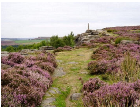
Nelson's Monument, Birchen Edge